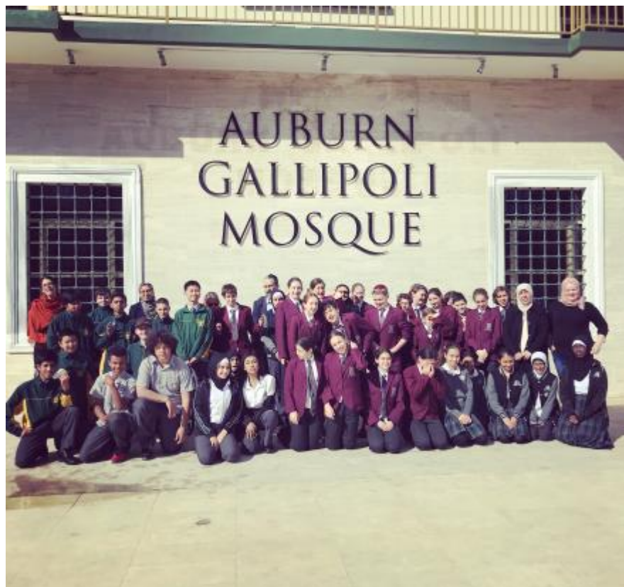
Photo: Emanuel School, Auburn Girls and Granville Boys at Gallipoli mosque for our inter-school program